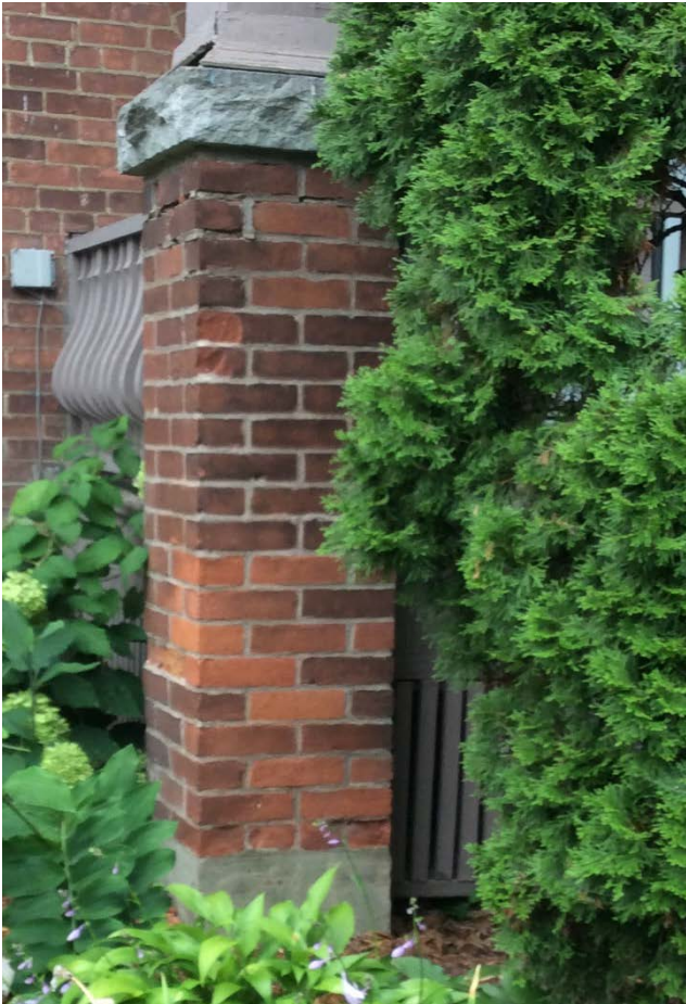
Joint failure & damaged brick