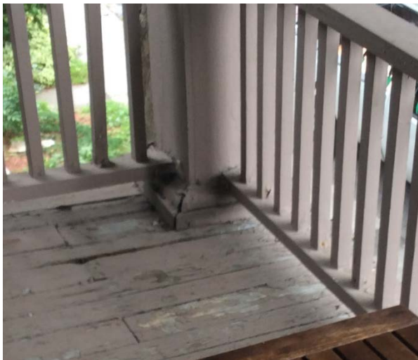
Damage to balcony floor deck