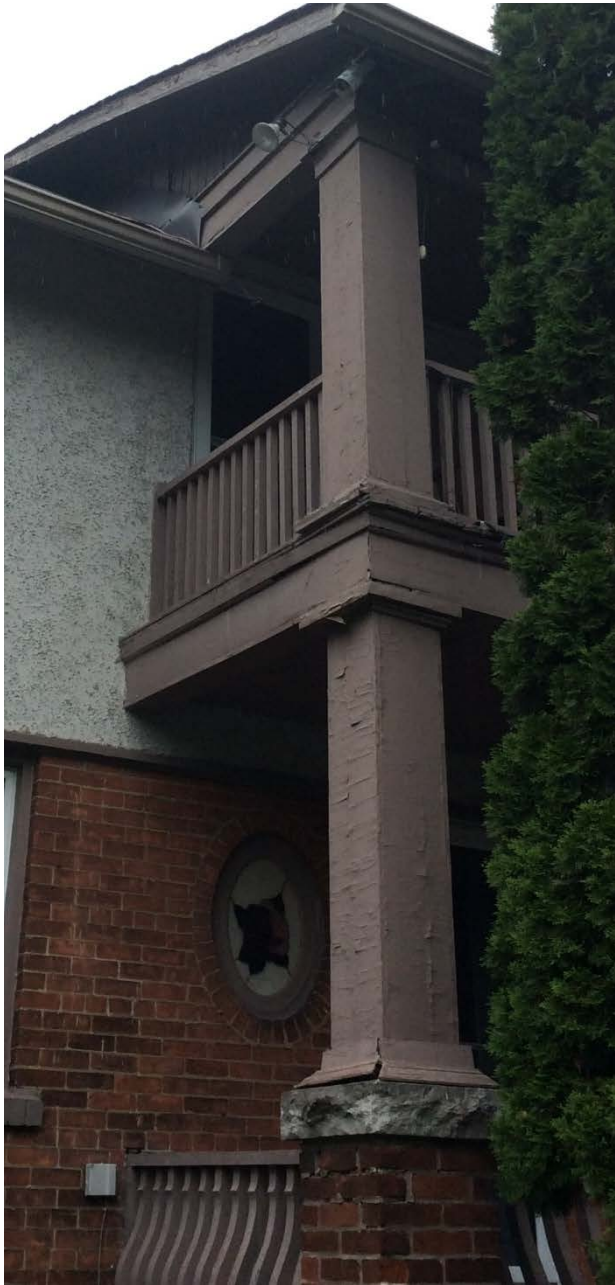
Damage to crown & column base