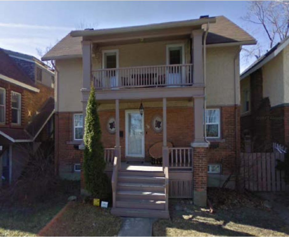
Circa 2009 Front Porch & Balcony

Brick column \pm 4\% incline needs leveling Also, verify footing cracks